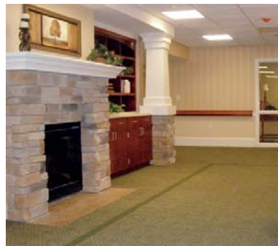
RIGHT: Generous gifts provided for this beautiful stone fireplace at Llanfair Retirement Community as part of the renovation of The Grove memory support care wing.