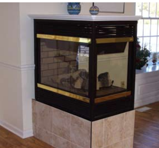
LEFT: During a recent renovation of The Vineyard on Catawba's Chalet, donations provided for the addition of this three-sided fireplace, which unites the living and dining rooms into one welcoming Great Room.

A special thank you goes to these donors and others who help enhance the lives of residents by helping to enhance OPRS projects! ■